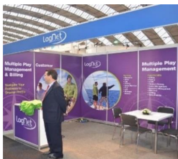
Booth with printed foam panels

The textile visual, based in a special aluframe, replaces or is fixed flat against the standard white panels.