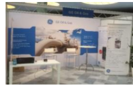
booth with textile walls