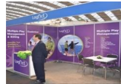
booth with foam panels