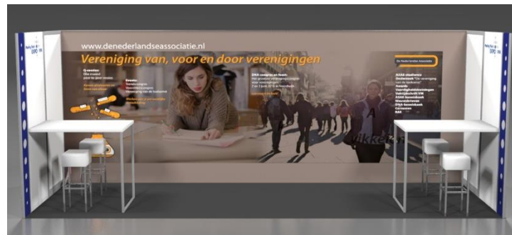
Booth with textile back wall and two basic plus furniture