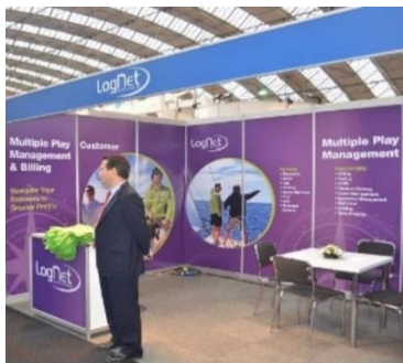
Booth with printed foam panels

The textile visual, based in a special aluframe, replaces or is fixed flat against the standard white panels.